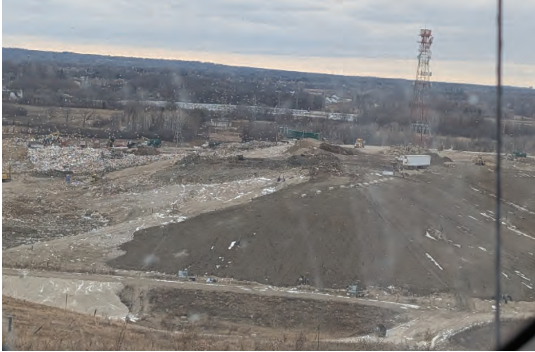
Intermediate cover being added to West slope of Phase 1