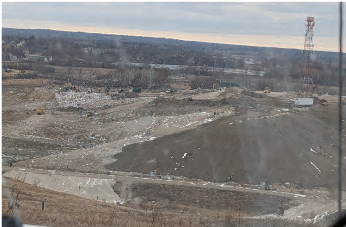
Overview of North Expansion West