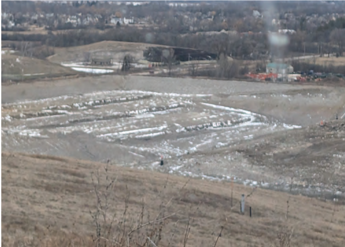
Future cell, Phase 4