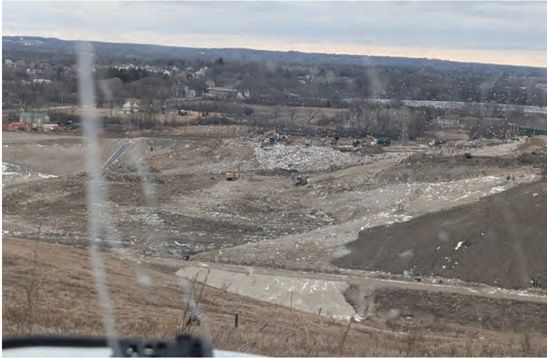
Phase 3 of North Expansion West