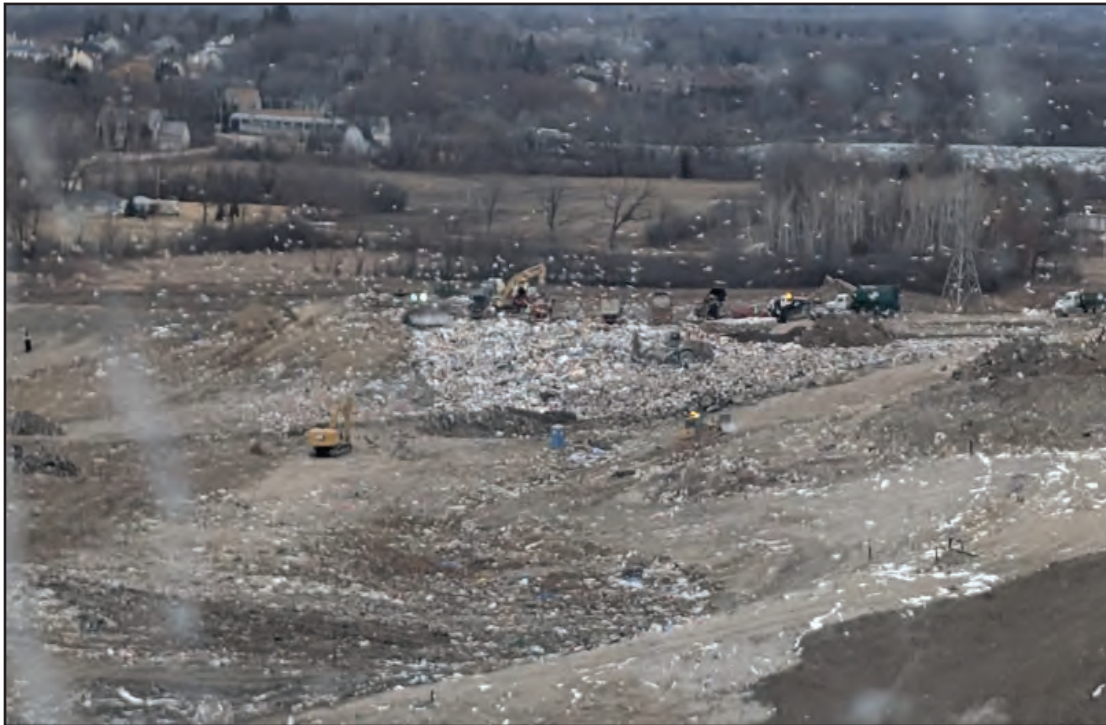
Working face at North end of Phase 3